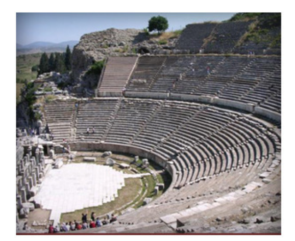
Ephesus Theater – - Location of Acts 19:24-34 events